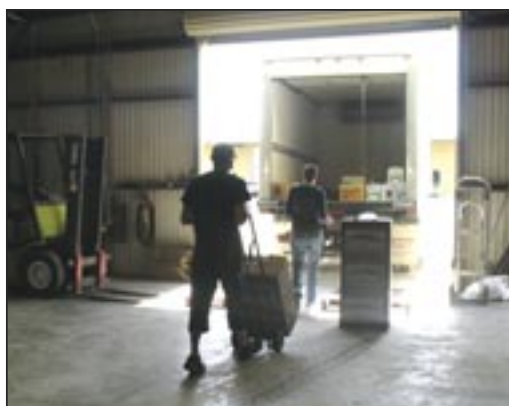
Capay Valley Farm Shop (CVFS), Esparto, Calif., is a direct-to-consumer and wholesale food hub in Central California. It does wholesale business with independent specialty retailers, restaurants and corporate cafeterias. Below: A Greenmarket Co. delivery truck makes its rounds.